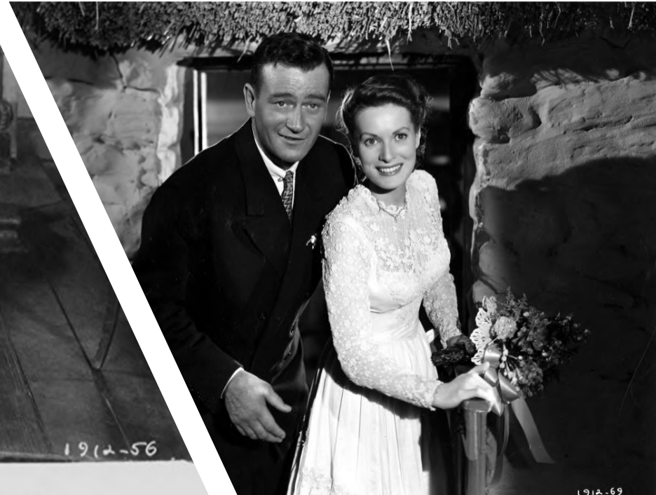
HERBERT J. YATES Presents JOHN FORD and MERIAN C. COOPER'S Argosy Production