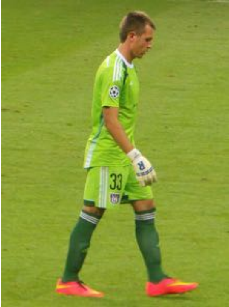
Jean-Marie Pfaff Belgian goalkeeper