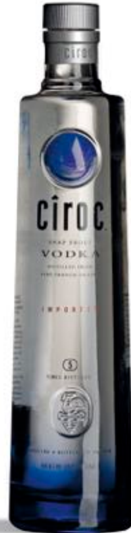
World's first Grape vodka